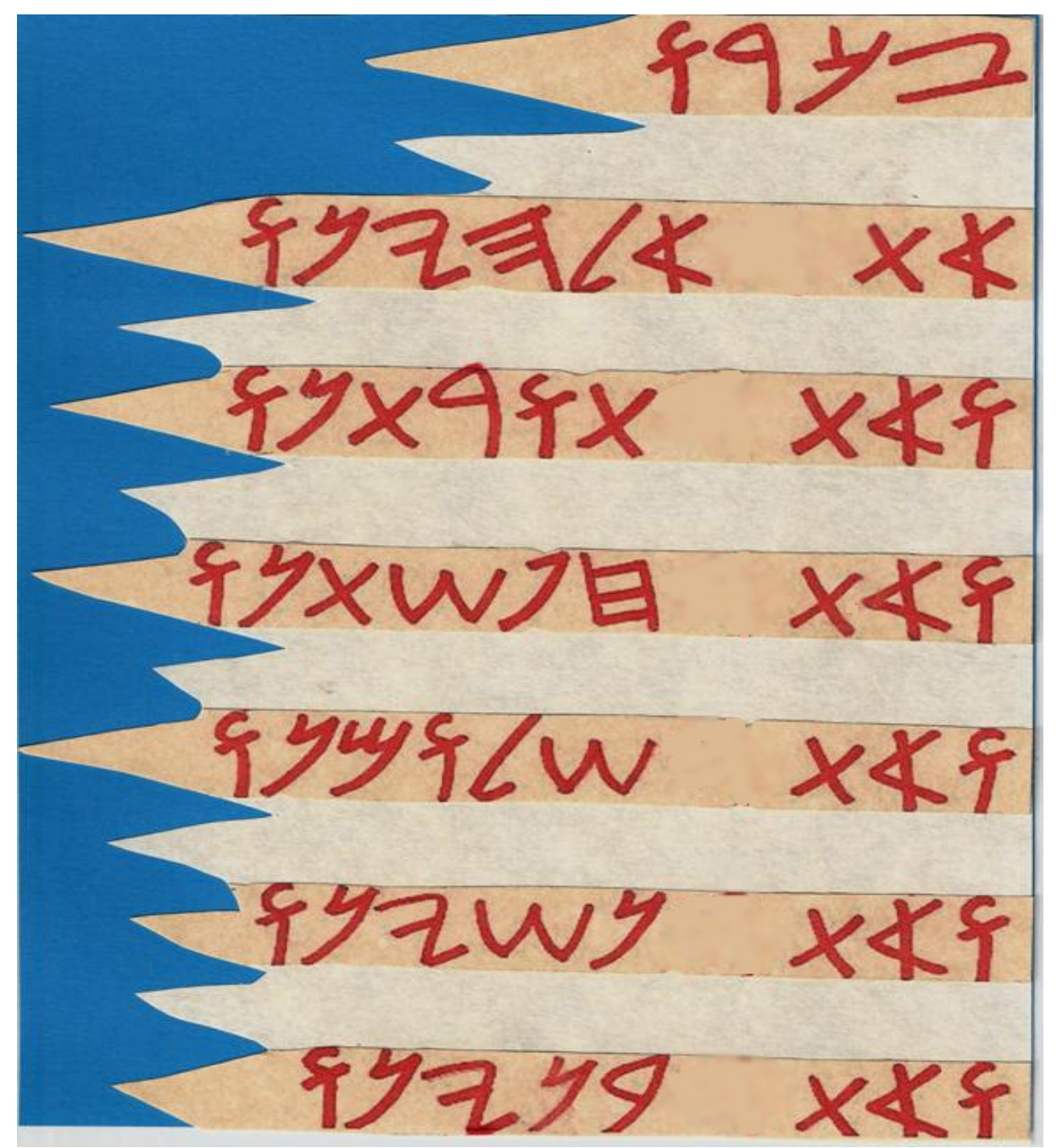
America's Ancient Banner of Liberty (Alma 46:12-28)

"And it came to pass that when he had poured out his soul to God, he named all the land which was south of the land Desolation, yea, and in fine, all the land, both on the north and on the south—A chosen land, and the land of liberty." (Alma 46:17)